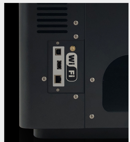
Rich connector interface Wifi/USB cable/U disk/LAN