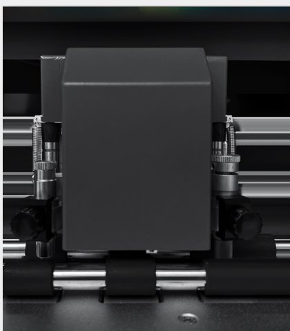
Dual heads dual heads with cut and crease function