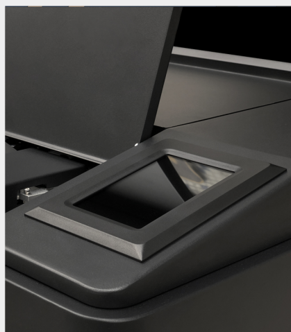
Large Colorful Touch Screen with More Concise UI