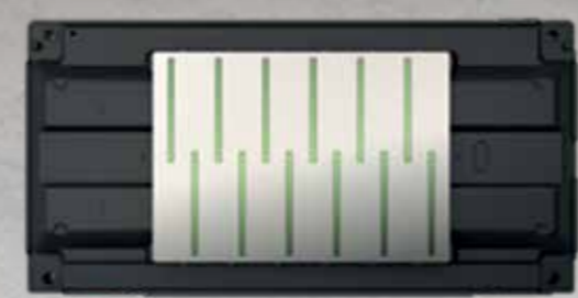
PrecisionCore Micro TFP printhead